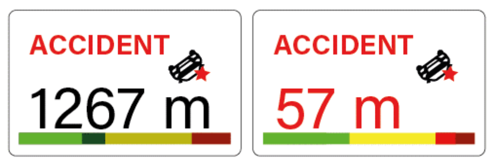
Appearing a crashed car.

Unjustified using or not using OK button or SOS switch might be penalised by stewards of the race.