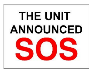
SOS – Medical emergency

What to do when you will see this screen? This is only a warning information, about possible road blockage following an accident. Display of this message is not related to receival of a notional time. Technically this is only general information for the crew that there might be some issue on the stage. It's to be evaluated by the crew after arriving to the stopped car if any action should be taken.