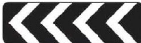
Vhodna tabla za šikano