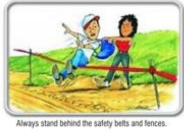
Always stand behind the safety belts and fences.