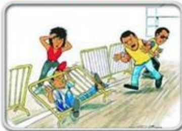
Do not obstruct the organizers in their work. If you can, help them.