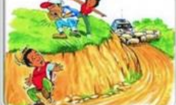
If you notice something that requires immediate intervention, please inform the nearest marshal.