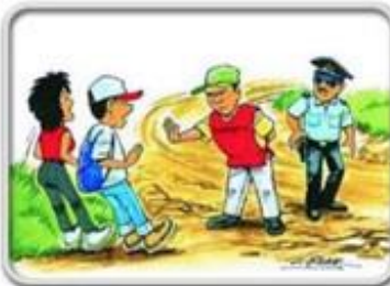
Do not approach dangerous places.