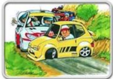
Be careful while driving on the rally itinerary.