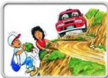
Do not stay in places with no possibility of escape in case of emergency.