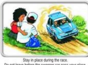
Stay in place during the race. Do not leave before the sweeper car pass your place.