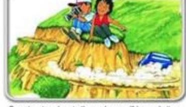
Do not go too close to the road, you will have a better view and you will be safer on a higher position.