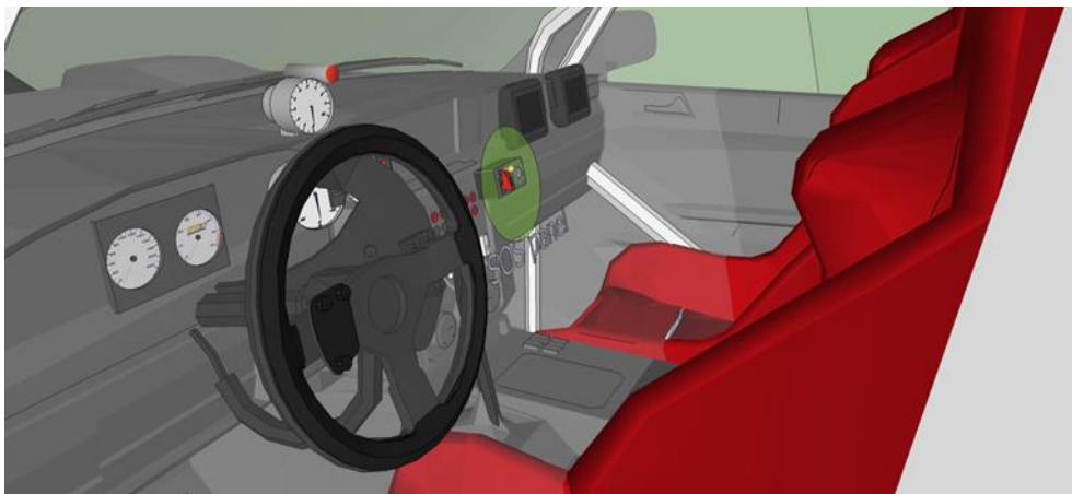
Pic. No. 6.: How to install 4.4

- To verify the functionality of the device will take place at the Technical Scrutineering.