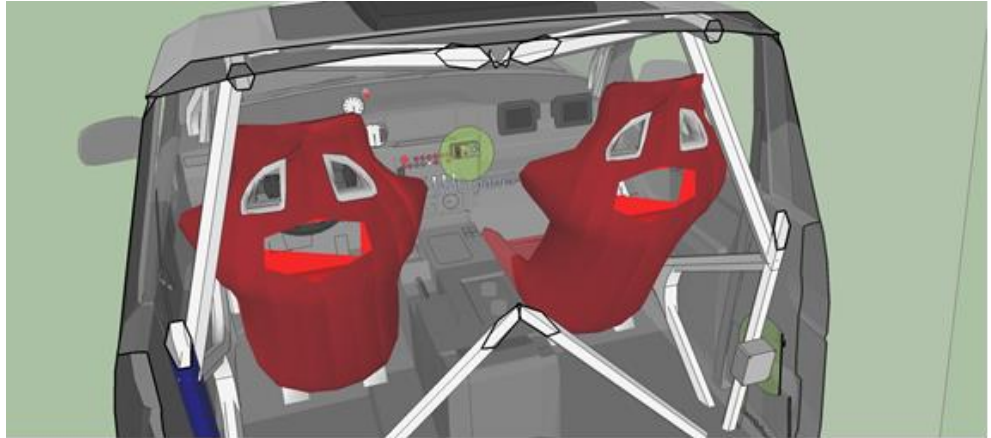
Pic. No. 5.: How to install 3.4