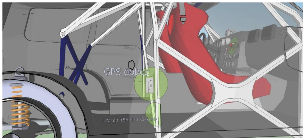
Pic.No. 3.: How to install 1.4

- Installing the device: The device received at the Administrative check must be connected to the previously purchased and installed SOS panel and vehicle to vehicle alarm system antenna. The device must be fixed in the right column B with 2 clamps so that the device does not move and the visibility ensured.