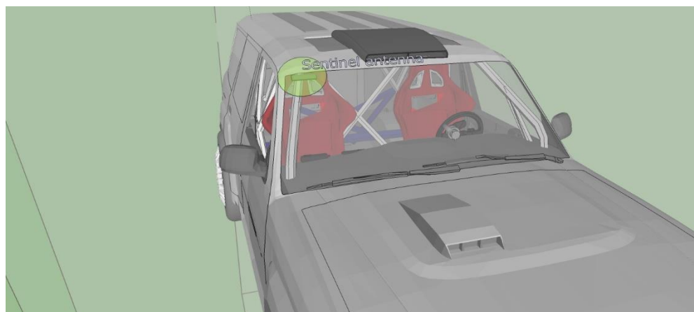
Pic. No. 4.: How to install 2.4