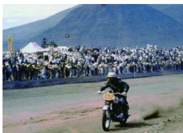
1957 2nd Asama Volcano Race.

Based on this history, the Tsumagoi Village Motorsports Promotion Organisation was established in 2009, headed by the mayor of Tsumagoi Village, with the participation of various departments of the municipal office, tourism-related organisations and organisations involved in motor sports in the village. Through various projects, the organisation aims to develop sound motor sports, improve safe driving techniques and morals, and tackle environmental issues, while pursuing new forms of motor sports in Tsumagoi Village, the birthplace of motor sports, and contributing to regional revitalisation and the promotion of traffic safety.