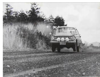
Mitsubishi Colt 1000F undergoing high-speed testing in