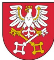
Eugeniusz Kurdas Starosta Wadowicki