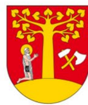
Szymon Duman Wójt Gminy Stryszów