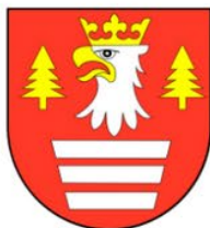
Józef Bałos Starosta Suski

Witold Kozłowski Marszałek Województwa Małopolskiego